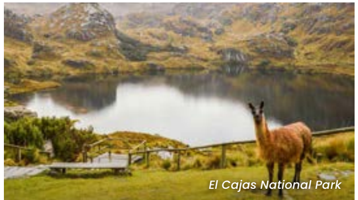
El Cajas National Park

Accommodation: Hotel Wyndham Guayaquil or similar (5 nights)