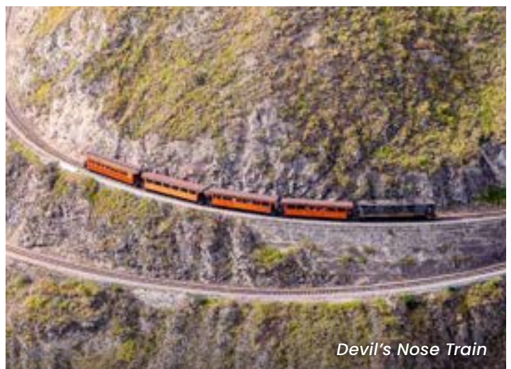
Devil's Nose Train

Accommodation: Hotel Oro Verde or similar (2 nights)