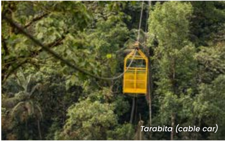
Tarabita (cable car)