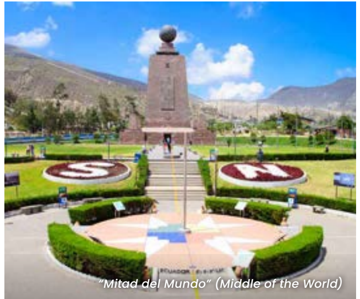
"Mitad del Mundo" (Middle of the World)

From here we head approximately 11 miles north of downtown Quito, to visit "Mitad del Mundo" (Middle of the World) and the Equator Monument situated at 0°0'0" latitude where the XVIII century French Geodesic Expedition erected one of the three pyramids as landmarks for their planet calculations. Here we see a typical central plaza, a church and bull-fighting ring. We also visit the ethnographic Museum. Dinner on your own.