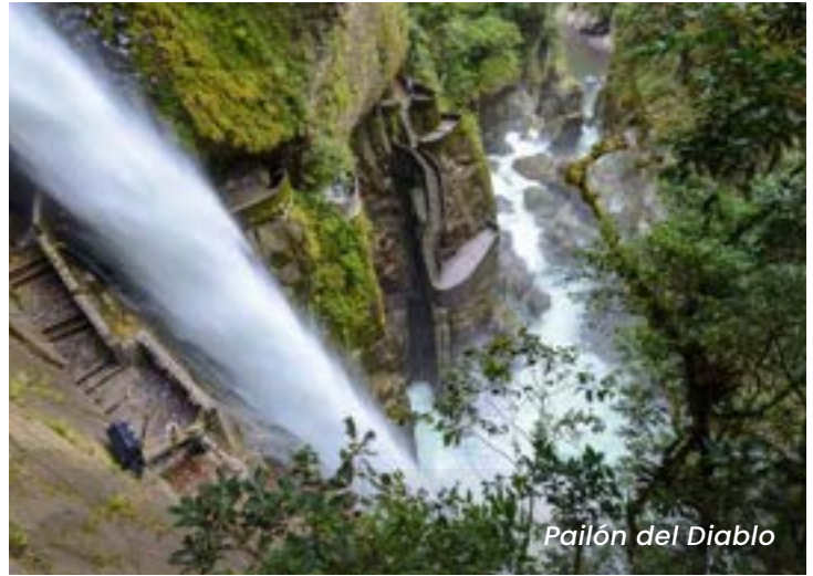
Pailón del Diablo

Accommodation: Hostería Andaluza or similar (1 night)