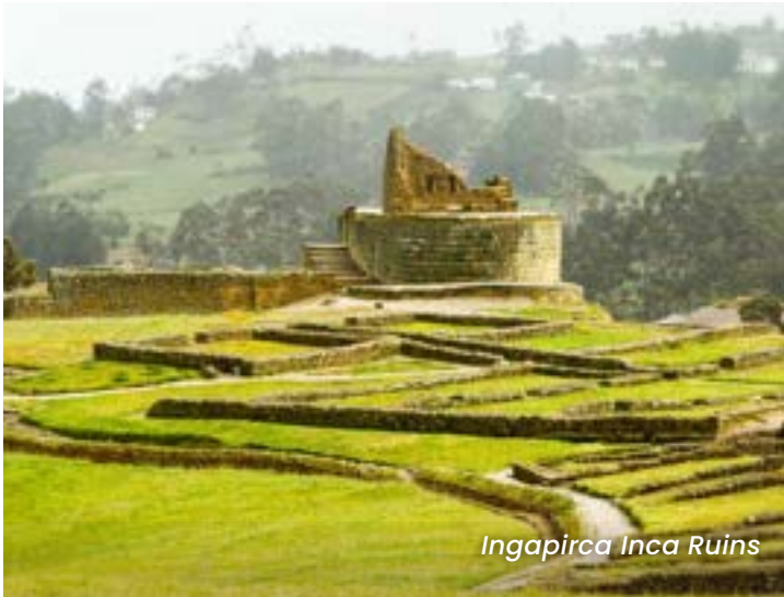
Ingapirca Inca Ruins