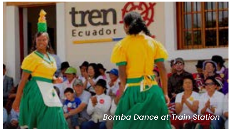
Bomba Dance at Train Station

The 26-km stretch takes 2 hours to complete, as the railway plunges from 2200 m. to 1500 m. above sea level. Enjoy a unique lunch at the Salinas Afro-Ecuadorian community restaurant, implemented by our land operator in an effort to boost tourism and cultural recovery in and around this fascinating area, with a vision of helping it become an important tourist destination. The menu has been carefully developed through a joint effort with the community and melds local savoir-faire with high quality standards. After lunch, visit the Salt Museum. Then return by coach to Otavalo in the afternoon. Dinner on your own tonight.