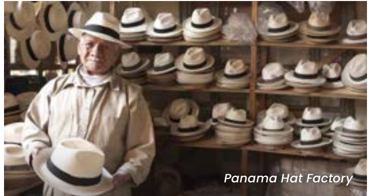
Panama Hat Factory