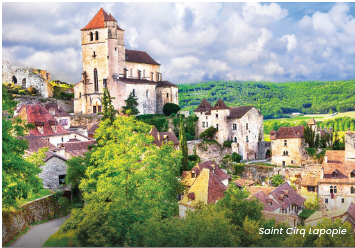
Saint Cirq Lapopie

Accommodation: Hotel Mercure Toulouse Centre Wilson Capitole or similar (3 nights)