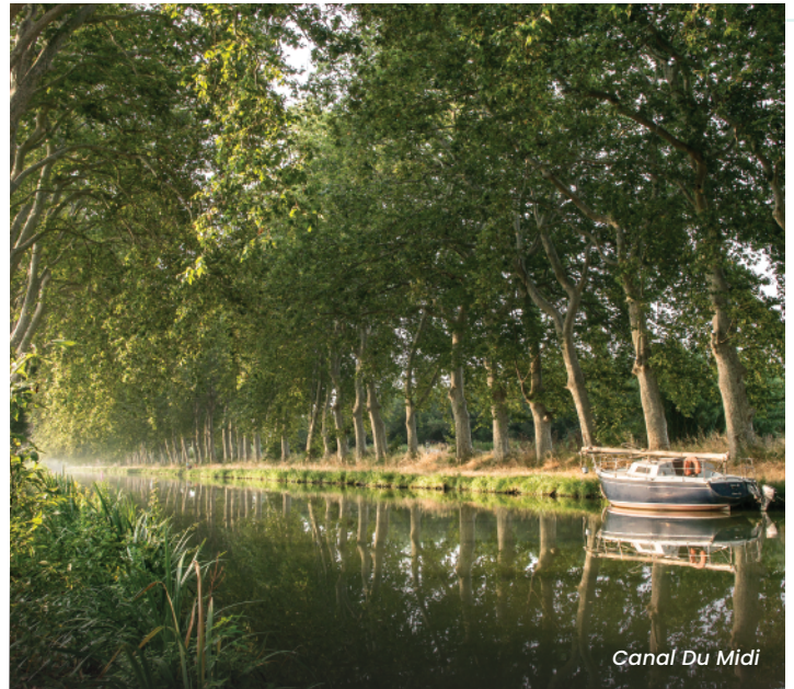
Canal Du Midi

Lunch at local restaurant before transferring back to your hotel. Remainder of the day at your leisure. Overnight in Toulouse.