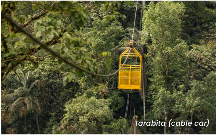
Tarabita (cable car)