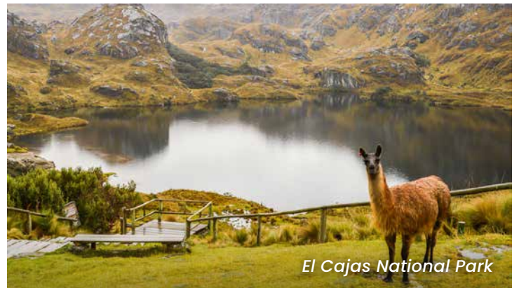
El Cajas National Park

Accommodation: Hotel Wyndham Guayaquil or similar (5 nights)