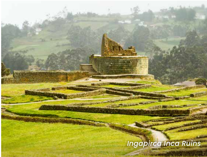
Ingapirca Inca Ruins