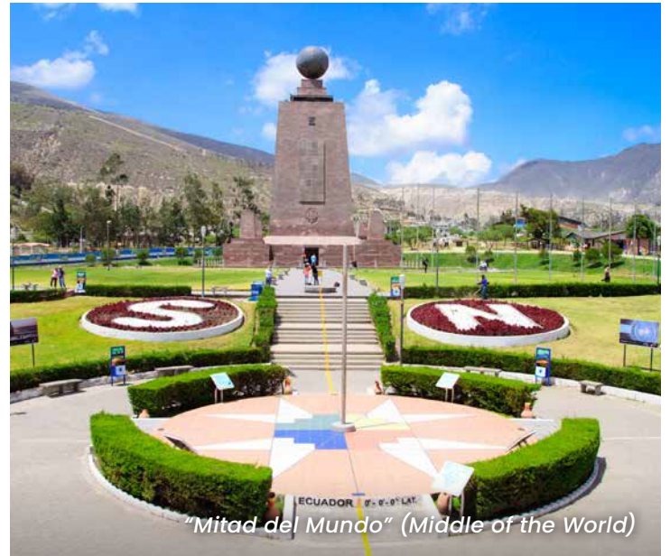
"Mitad del Mundo" (Middle of the World)

From here we head approximately 11 miles north of downtown Quito, to visit "Mitad del Mundo" (Middle of the World) and the Equator Monument situated at 0°0'0" latitude where the XVIII century French Geodesic Expedition erected one of the three pyramids as landmarks for their planet calculations. Here we see a typical central plaza, a church and bull-fighting ring. We also visit the ethnographic Museum. Dinner on your own.