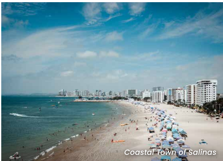
Coastal Town of Salinas

From small fishing villages to resort towns, the Pacific Coast of Ecuador is home to some of the most beautiful beaches in South America. Today we take a day trip to the coastal town of Salinas. It is known for its upscale beach lifestyle and such popular beaches as San Lorenzo and Chipipe. People travel from all over the world because the surfing in Ecuador offers an ideal climate all year round. Following lunch we go on a whale watching cruise. Migratory humpback whales pass the rocky point of La Chokolatera, which offers panoramic views over the Pacific Ocean. Every year from June to September, the Ecuadorian coast is visited by these giants of the sea, making Ecuador an impressive whale watching destination. Their habitat is at the south part of the continent, in the Antarctic region, where there is abundance of fish, their main food. As they are migratory mammals, they begin their journey through the Pacific Ocean to the north until they reach the coast of Ecuador. This journey of about 4,320 miles takes about 3 months.