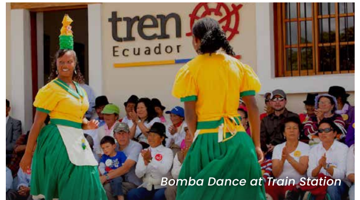
Bomba Dance at Train Station

The 26-km stretch takes 2 hours to complete, as the railway plunges from 2200 m. to 1500 m. above sea level. Enjoy a unique lunch at the Salinas Afro-Ecuadorian community restaurant, implemented by our land operator in an effort to boost tourism and cultural recovery in and around this fascinating area, with a vision of helping it become an important tourist destination. The menu has been carefully developed through a joint effort with the community and melds local savoir-faire with high quality standards. After lunch, visit the Salt Museum. Then return by coach to Otavalo in the afternoon. Dinner on your own tonight.