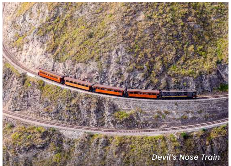
Devil's Nose Train

Accommodation: Hotel Oro Verde or similar (2 nights)