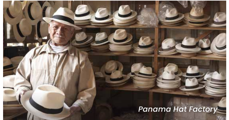
Panama Hat Factory