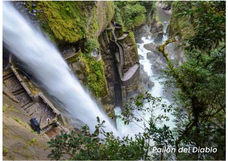
Pailón del Diablo

Accommodation: Hostería Andaluza or similar (1 night)