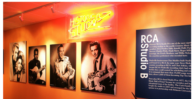
RCA Studio B

Breakfast on your own today with USD10 allowance from Tour Design. We depart with our guide for a morning tour at the historic RCA Studio B, the oldest surviving recording studio in the city. Beyond the countless recordings made by legendary artists here, Elvis Presley is known to have made more than two hundred song recordings at this location. Lots of fun today as we record our own song and have a souvenir CD to take home. Free time downtown for shop and have lunch on your own. Dinner on your own today with USD20 allowance from Tour Design.