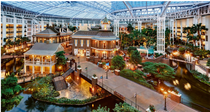
Gaylord Opryland Hotel and Resort

Accommodation: Gaylord Opryland Hotel (4 nights)