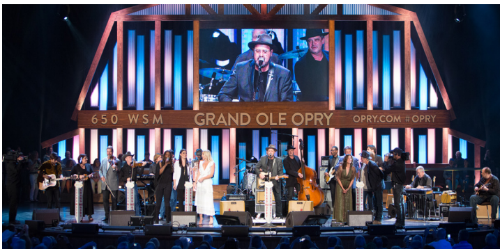
Grand Ole Opry Show – Photo credit: Chris Hollo