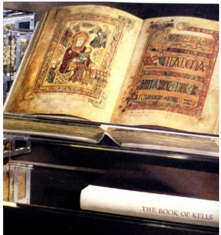
Book of Kells

4* Oriel House Hotel or similar (2 nights)