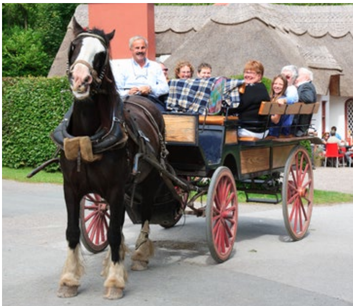
Jaunting Cart Ride, Killarney

This evening enjoy dinner on your own in one of the many restaurants or pubs in the area. Suggestions will be provided.