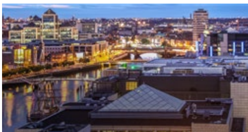
Dublin City View