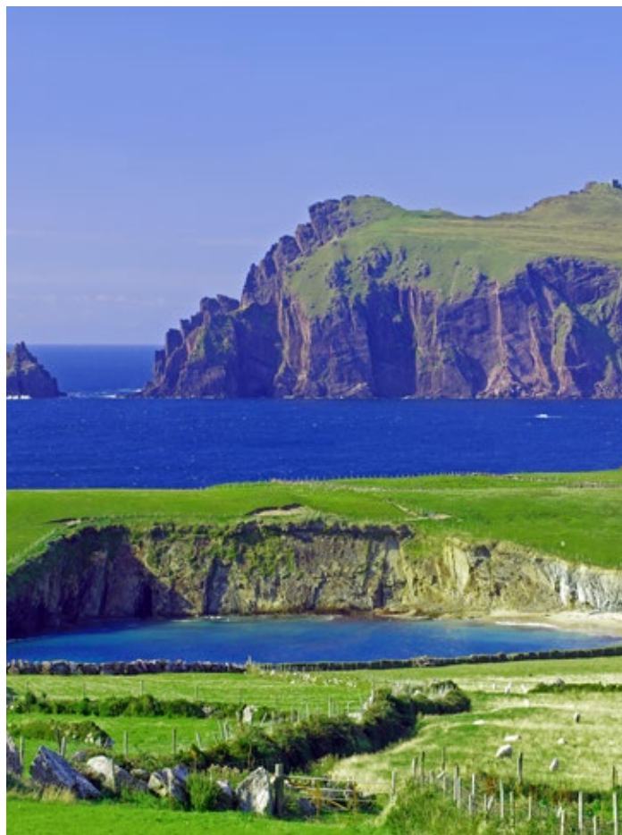
Ring of Kerry

4* Killarney Court Hotel Kerry or similar (2 nights)