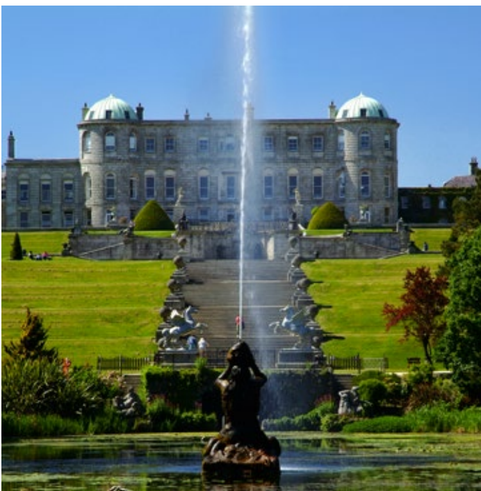
Powerscourt House and Gardens

The Merry Ploughboys live in concert is widely regarded as the best traditional music show in Dublin and also as a must see. The show is a highly entertaining performance of live traditional Irish music, song and Irish dancing.