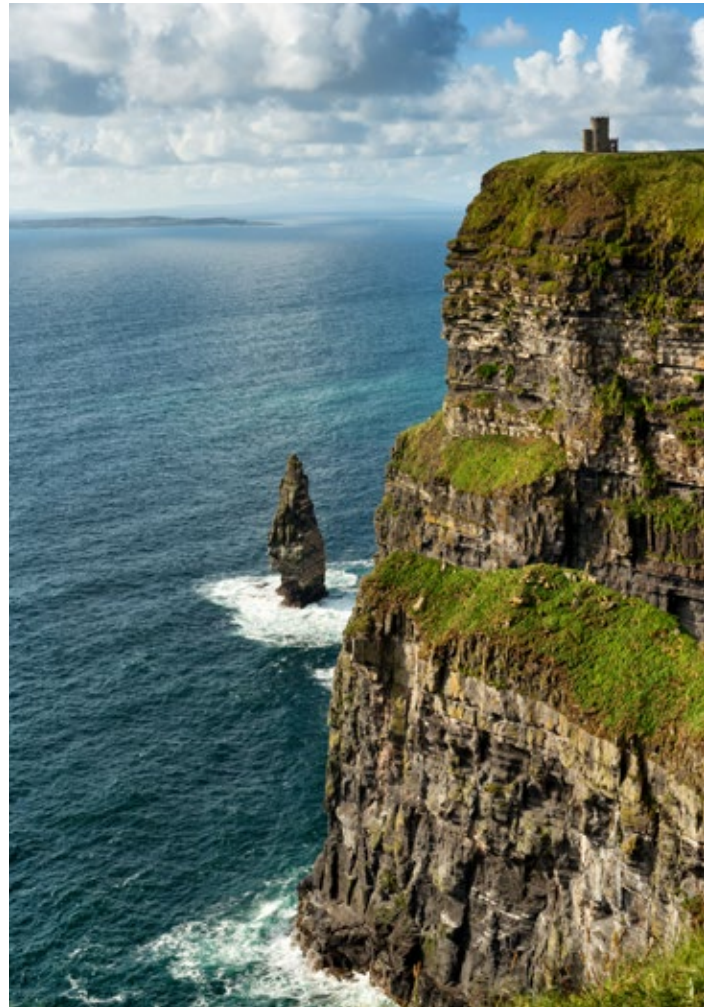
Cliffs of Moher

4* Hotel Ballina in Ballina or similar (2 nights)