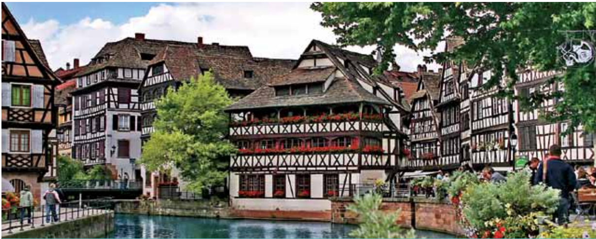
Strasbourg UNESCO World Heritage site • Day 5

In the early afternoon you will take an Alsace & wine excursion to experience the unique atmosphere of this region. Alsace is part of the Rhine valley corridor, one of the most important trading routes in Europe since the Middle Ages. Enjoy the drive through a picturesque landscape with romantic wine villages where the tradition of brightly coloured half-timbered houses has become firmly established as the local Alsatian style. Travelling on part of the famous wine route, we visit a local winery and taste some regional wines. We return to our ship for dinner. (Breakfast, lunch and dinner)