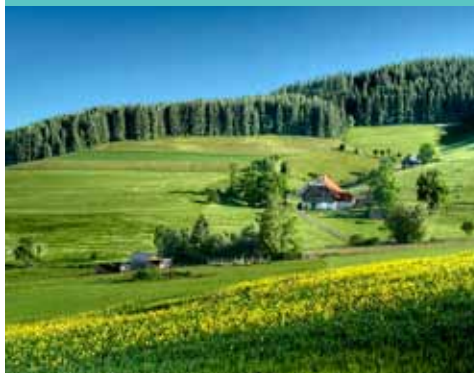
Black Forest Excursion • Day 4