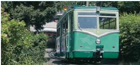
Ride the oldest cog railroad in Germany • Day 10