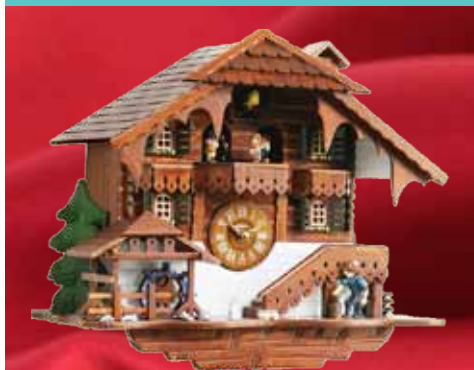
Mechanical Music Cabinet, Ruedesheim • Day 6