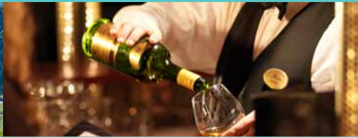
Alsace & Wine Excursion • Day 5