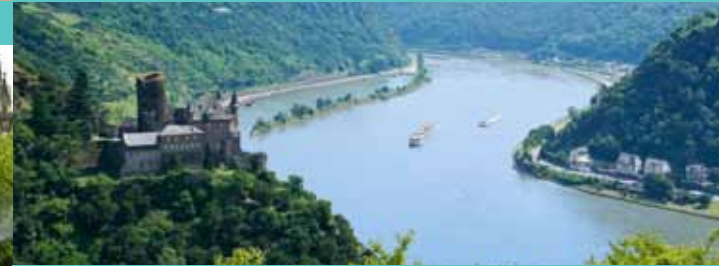
Scenic Moselle River • Day 7