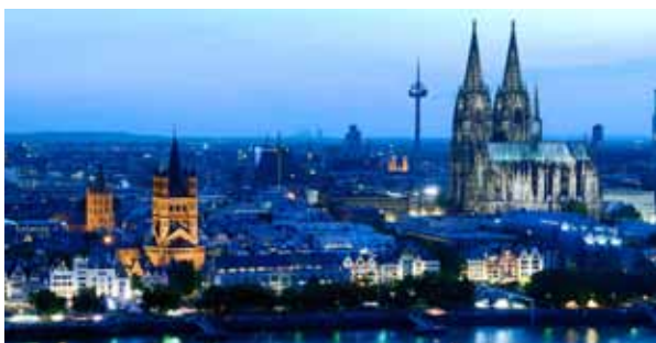
Cologne UNESCO World Heritage site • Day 10

Cologne straddles both sides of the Rhine and is known for its soaring twin-steeped gothic spires of its cathedral (Kolner Dom), a master piece of High Gothic architecture, and a UNESCO World Heritage site. It was saved by the allied bombing crews because it was used as a navigational aid. It was one of the few landmarks easily recognizable from that high altitude. Most everything in the center of Cologne was destroyed during the WWII, except for this cathedral. Its art treasures include a shrine housing the relics of the Three Holy Kings (three Magi from Milan). The city is regularly voted the country’s single most popular tourist attraction. The city’s museum landscape is especially strong when it