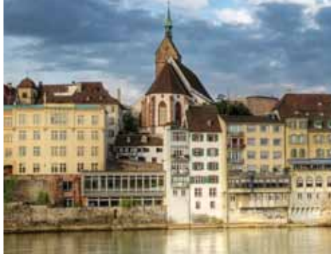
Moored overnight in Basel • Day 1

Welcome to Basel, We arrive into Basel, Switzerland's third most populous city (behind Zurich and Geneva), with 195,000 inhabitant located where the Swiss, French and German borders meet. Some free time for lunch before transferring to the pier for embarkation in the late afternoon onto their newest flagship in the innovative AMADEUS fleet, namely the MS AMADEUS SILVER (NEW), to be launched in early 2016 (a twin of the Amadeus Silver II launched in 2015 (used for the total number of cabins). Numbers in brackets indicate the number of cabins allocated to Tour Design/Probus. The AMADEUS SILVER (NEW) has a total of 54 (34) enlarged standard cabins. Those on the Mozart and Strauss decks will have a unique form of French balcony – the upper half of the floor to ceiling window wall lowers to bring the outside in – giving your stateroom its own "balcony". The 12 (4) AMADEUS Balcony Suites have 'walk-out' exterior balconies with their own seating groups, enormous panoramic windows and comfortable bathrooms