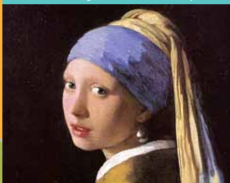
See Dutch Masterpiece • Day 12