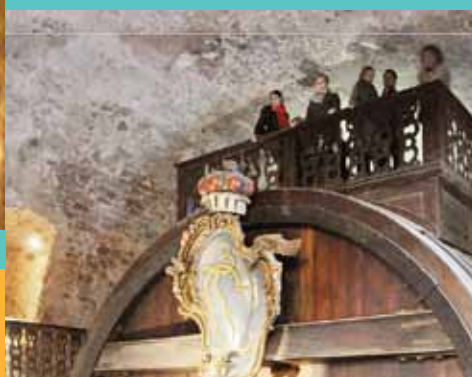
World's Largest Wine Barrel • Day 6