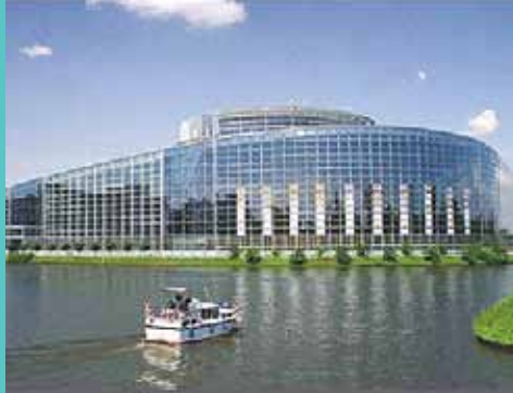
European Parliament • Day 5