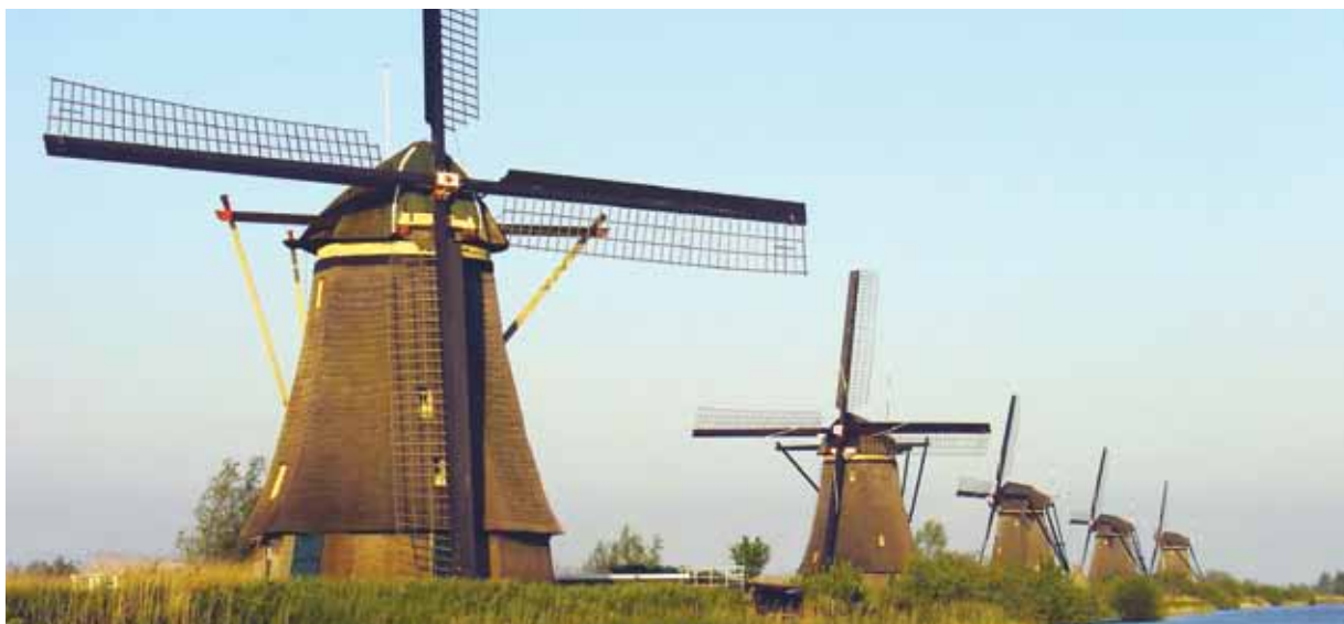
Kinderdijk UNESCO World Heritage site • Day 12