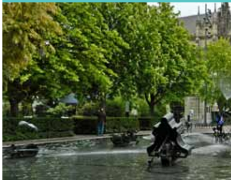
Moving Fountain, Basel • Day 3