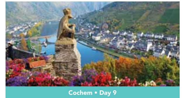
Cochem • Day 9

This morning you wake up in the episcopal city Trier, Germany's oldest city colonized in 2000 BC. It was a favoured residence of several Roman emperors, including Constantine the Great. The Roman baths are still visible today, as is the mighty Cathedral Constantine. Some say that Trier is even older than Rome and that it was populated over a thousand years before the Romans arrived. An included city walk through Trier's market square is one of the nicest squares in Germany, filled with fruit stands, flowers, painted facades and fountains. See the Roman Baths and the Porta Negra- both sure to delight you. Trier's most famous son was socialist revolutionary Karl Marx. After lunch, our coach takes us to Luxembourg. Small in size, Luxembourg is steeped in history, tradition and culture and is the world's only remaining sovereign Grand Duchy. The country is a founding member of the European Economic Community and plays a significant role in the European integration process. The capital city of Luxembourg is the administrative seat of the European Union. In the early evening the ship casts off, heading to Cochem. (Breakfast, lunch and dinner)