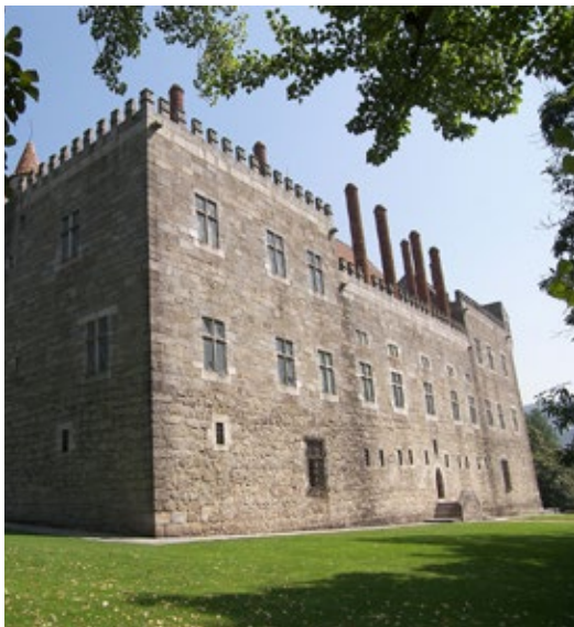
Palace of the Dukes of Braganza

Today, you have a choice between two tours. First is an excursion to Guimaraes that brings you to one of the most historic towns in Portugal, a UNESCO World Heritage site. Portugal's history comes alive as you see the city's 10th century castle and Dukes of Braganza Palace. If you prefer, you can join the group that will be enjoying a guided hiking tour along the Douro River. Enjoy some scenic cruising this afternoon through the Douro Valley on our way to Regua. Dinner on board followed by dancing or a stroll through Regua by night. (Breakfast, lunch and dinner)