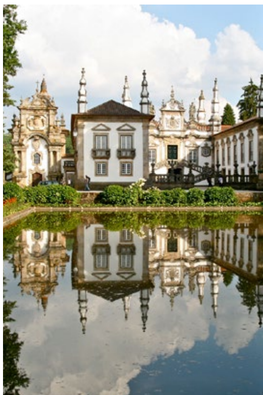
Palacio de Mateus

Known as Spain's "golden city," Salamanca is rich in architectural, religious and gastronomic culture and a UNESCO World Heritage Site. Today we tour this city and marvel at the La Casa de las Conchas (house of shells) and the 18th century Plaza Mayor. Both the Old and New Cathedrals of Salamanca are celebrations of Renaissance and Gothic styles. But the city owes its most essential features to the University. The remarkable group of buildings in Gothic, Renaissance, and Baroque styles, which, from the 15th to 18th centuries, rose to the institution that proclaimed itself "Mother of Virtues, Sciences, and the Arts", makes Salamanca an exceptional example of an old university town in the Christian world, such as Oxford and Cambridge. You will also have the option to discover this city today on a bicycle tour as well. Enjoy an evening of entertainment after dinner. (Breakfast, lunch and dinner)