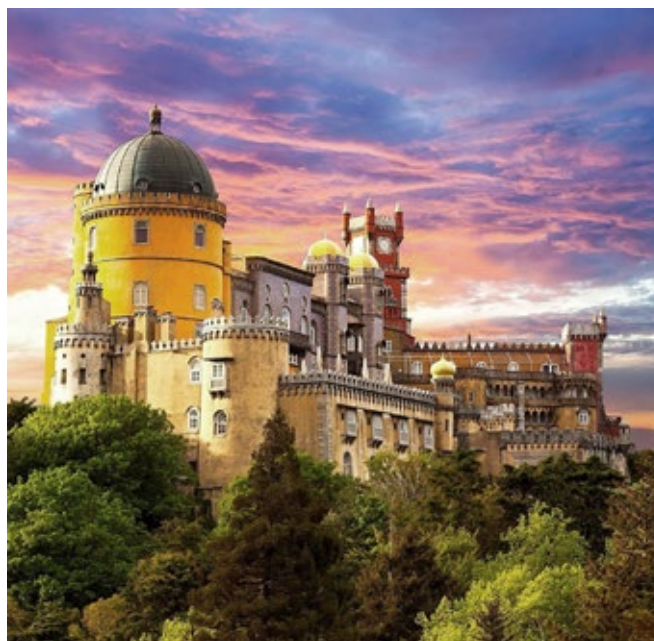
Castelo da Pena