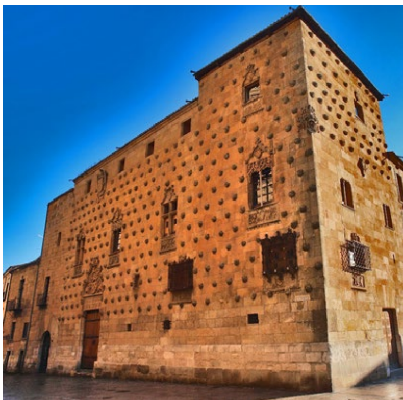
La Casa de las Conchas