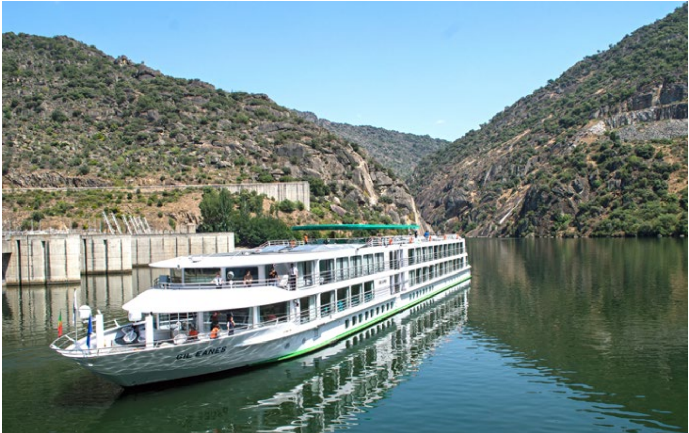
MS Gil Eanes at Douro Valley

Oct 15 / AC 877 / Frankfurt – Toronto / depart 5:15pm / arrive 7:30pm