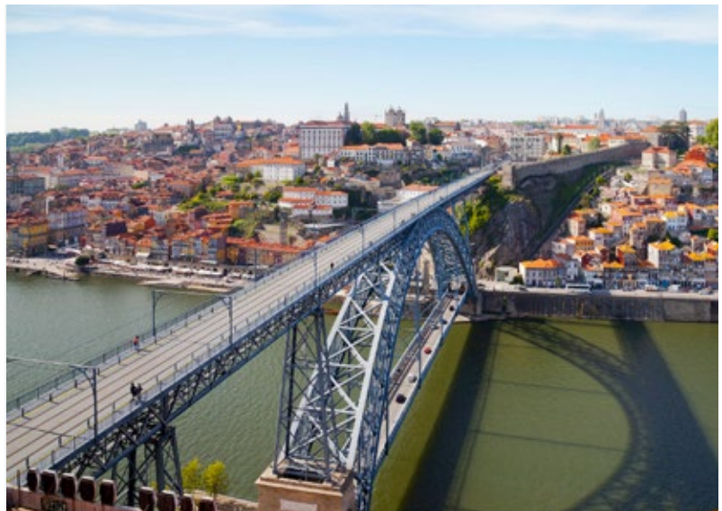
Dom Luís I Bridge