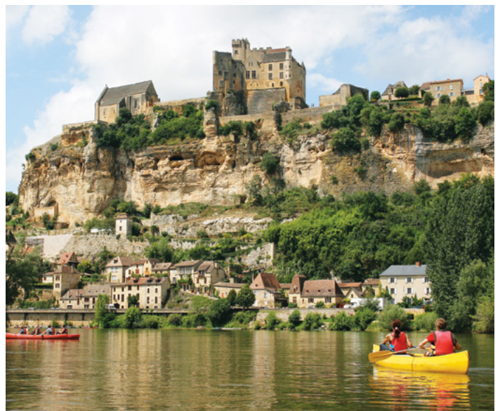
Beynac et Cazenac

Overnight in Sarlat. Dinner on your own this evening.