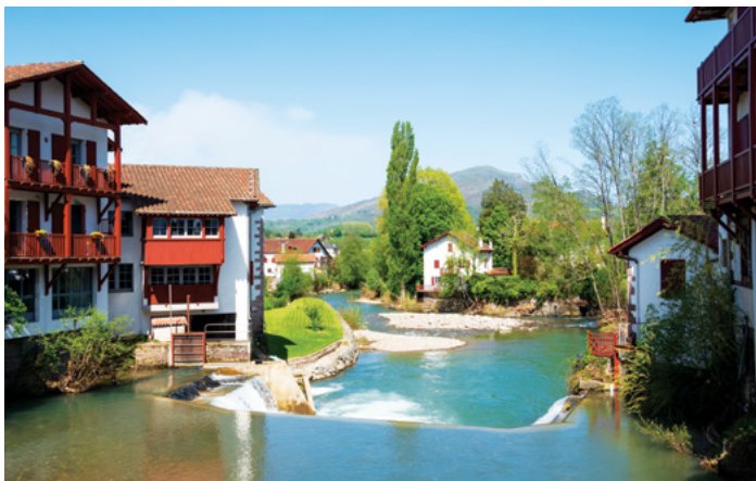
Saint Jean Pied de Port