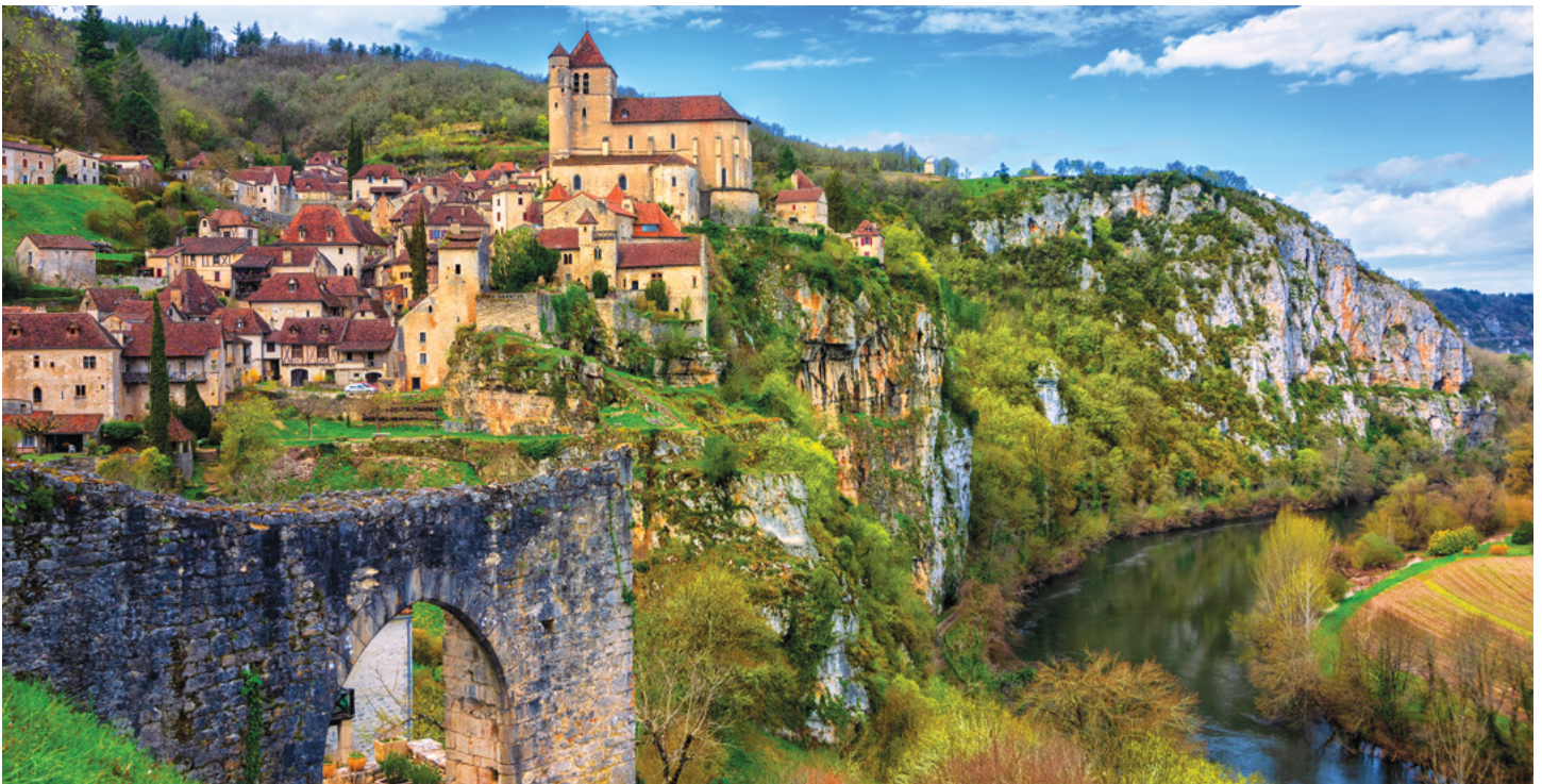
Saint Cirq Lapopie

Accommodation: Best Western Athénée or similar (2 nights)