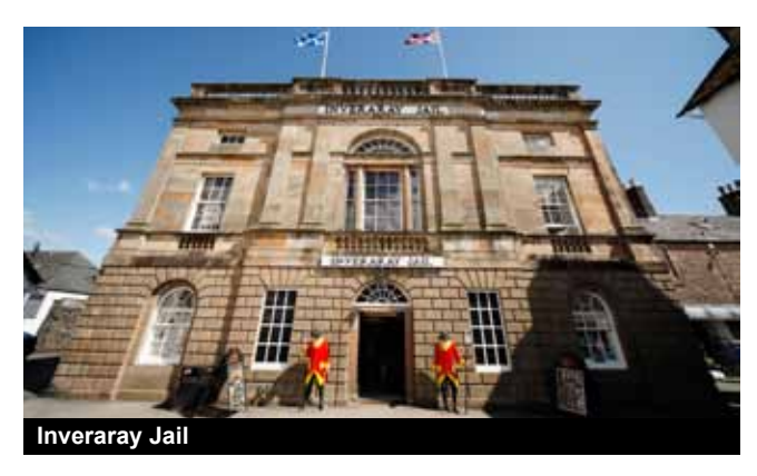
DAY 5 / Sunday, May 19, 2019