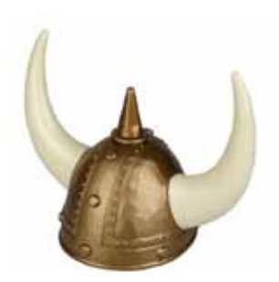
DAY 11 / Saturday, May 25, 2019