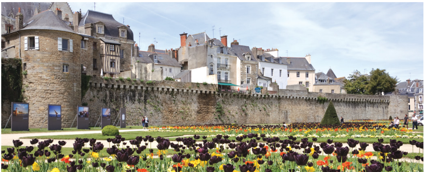
Brescia – Lake Iseo

Accommodation: Best Western Plus Hotel Le Roof Vannes or similar (2 nights)