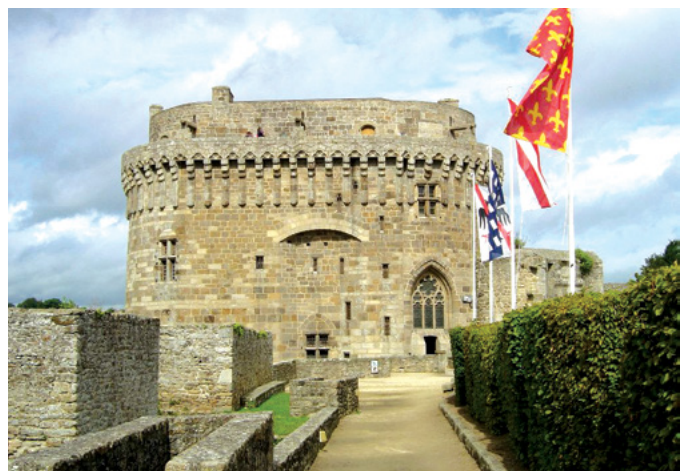
Château de Dinan