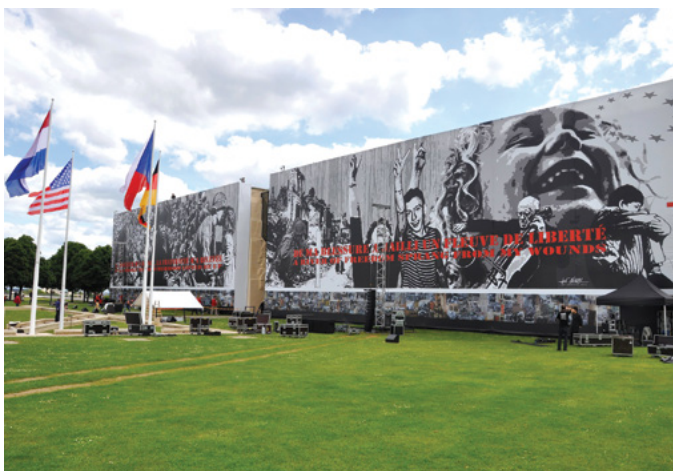
Mémorial de Caen

We return to St. Malo. Evening on your own.