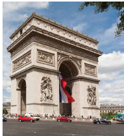
Arc de Triomphe Paris

Tonight we celebrate with a final farewell dinner. There is nothing more French, or more specifically, Parisian, than an evening meal in one of the city's many French Brasseries. Sitting on a cozy banquette or on an open terrace, eating, drinking and people-watching is one of the most cherished past-times in France. A brasserie has a relaxed setting, offering contemporary cuisine and regional products. Celebrated artists, writers, and musicians frequented many of these traditional Paris restaurants and many owners have done their best to retain that old-Paris glamour. We see this is a great venue to share the memories of our last 12 days in France.