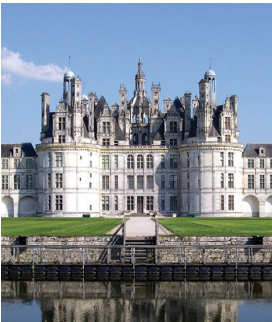
Château de Chambord