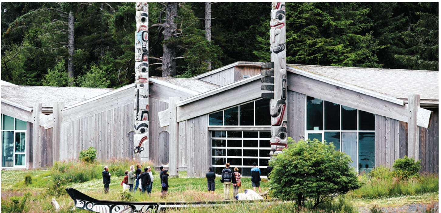
Haida Heritage Centre

Crab boil for dinner this evening at our lodge.