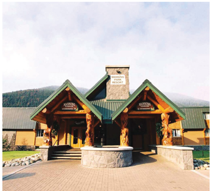
Manning Park Lodge