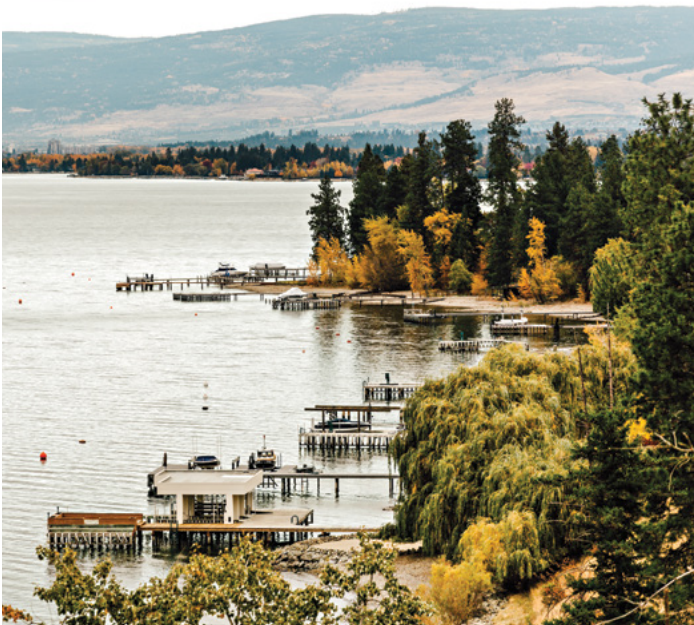
Downtown Kelowna at Near Cedar Creek Park

Accommodation: Spirit Ridge at Nk'Mip Resorts (2 nights)