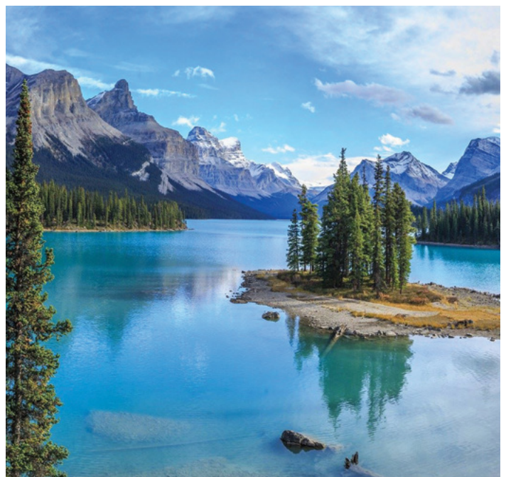
Jasper National Park