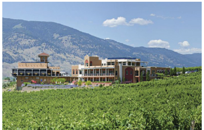
Owl Estate Winery

We return to our hotel late afternoon for dinner at our hotel.