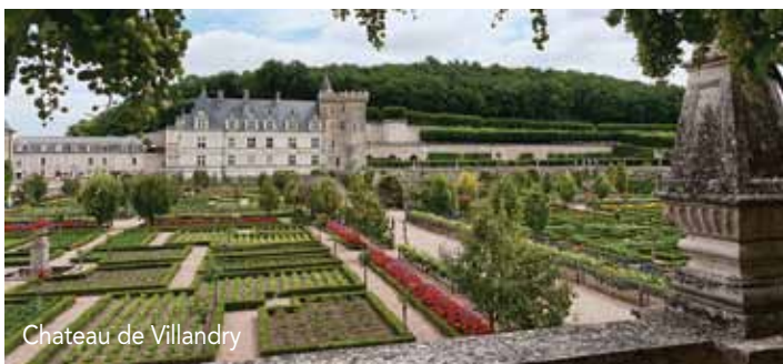
Chateau de Villandry

Air Credit of $750 per person if arranging own air Initial Deposit: $500 at time of booking Second Deposit: $1,000 by Oct 08, 2013 Final Balance: on Feb 08, 2014