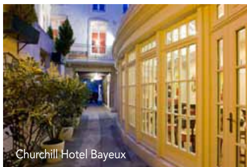
Churchill Hotel Bayeux

Day 7 Wed, May 14, 2014 Tours Today we visit Tours and tour through the magical Chateau Chenonceau, rated #1 of 84 attractions in The Loire Valley by Trip Advisor. A beautiful country villa surrounded by a moat and