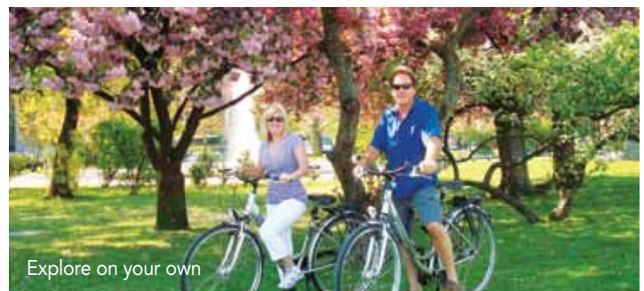
Explore on your own